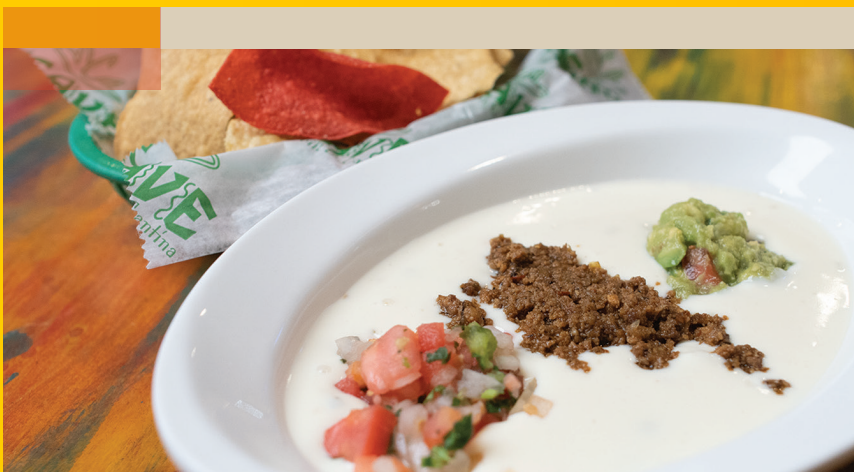
QUESO DE AGAVE